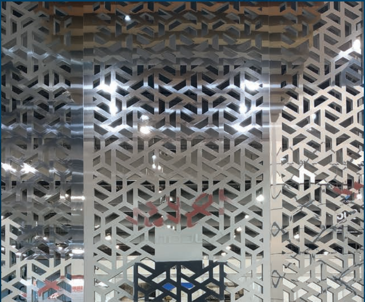
LATTICE STRUCTURE, SMR