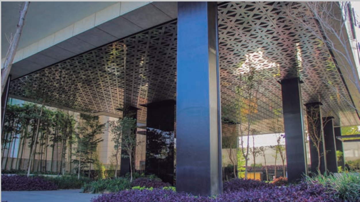
CEILING CELOSIA, ALUCOMEX SMR PANEL