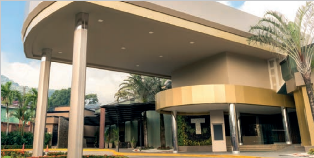
DETAILS AND FULL COLUMNS, SMR