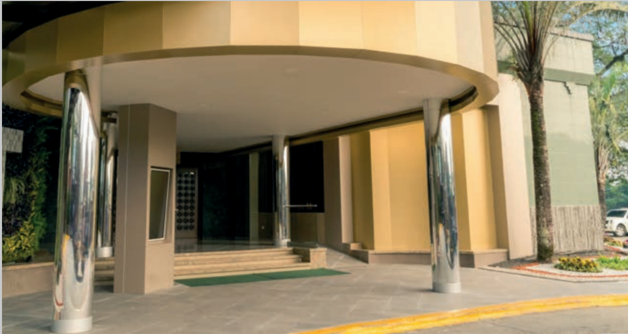
EXTERIOR COLUMNS, ALUCOMEX SMR PANEL